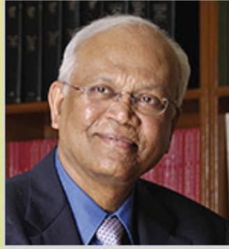
Dr. Raghunath Anand Mashelkar Former Director General, CSIR (Chair of CII Industrial Intellectual Property Award -2019)