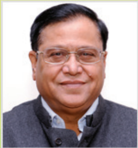
Shri Vijay Kumar Saraswat Former Director General , DRDO Member - NITI Aayog